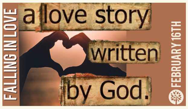
Mark 12:30 Love the Lord your God with all your heart, with all your soul, with all your mind, and with all your strength.